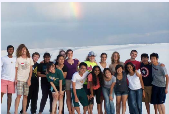
Fun in the gypsum at White Sands National Monument