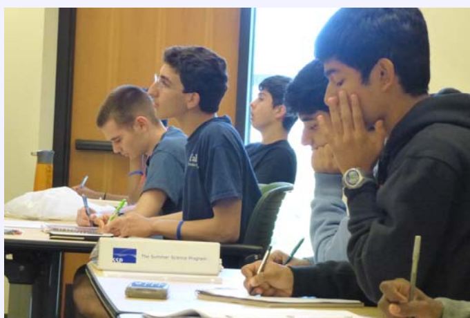
Furious note-taking in the classroom at Westmont